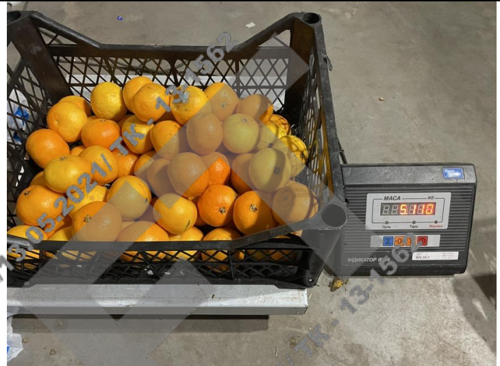
Weight of bad cargo