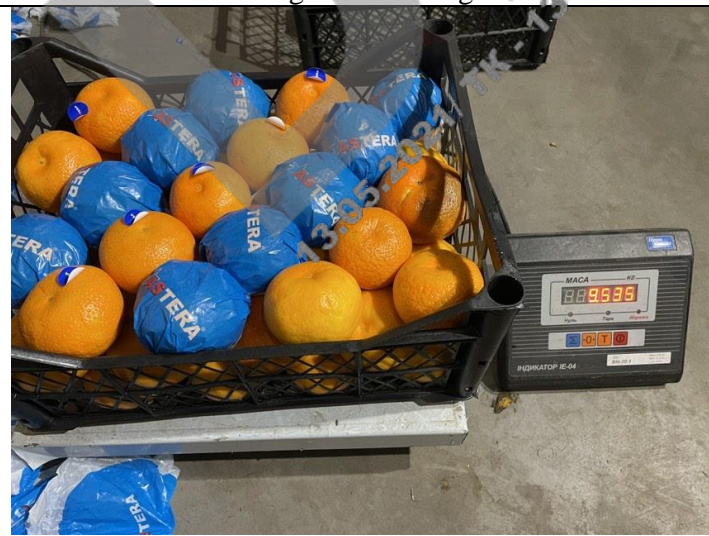
Weight of № 4 box