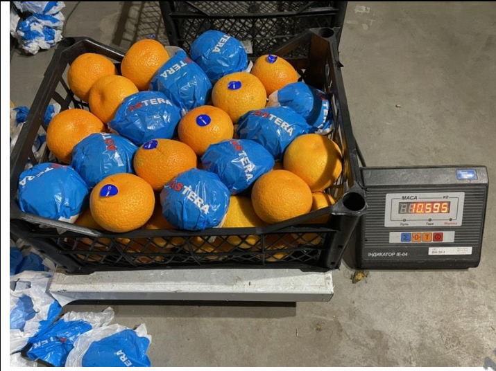
Weight of № 1 box

CISS GROUP UKRAINE LLC 65037, Lymanka village, Ovidiopol district 5, Odessa Blv., Odessa region, www.ciss-group.com