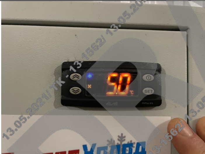
Temperature in warehouse