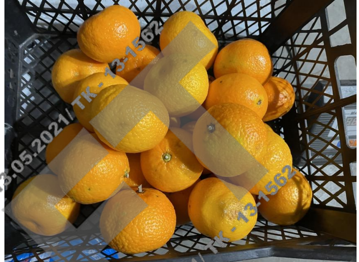
View of bad cargo

This inspection has been performed on the goods for which it was requested according to our professional standards and to the best of our knowledge on the date and at the place it was performed, within the scope of instructions received. This inspection does not release seller(s) and/or supplier(s) and/or shipper(s) and/or other parties involved from their respective contractual obligations and does not prejudice the buyer(s)/receiver(s)' right to claim, under applicable law and contract, compensation from seller(s)/supplier(s)/shipper(s) regarding any defects not detected during our inspection or occurring thereafter. This inspection is also subject to CISS GROUP Terms and Conditions of Business ( http://www.ciss-group.com ). Headings and titles in this certificate/report are for reference only and the findings contained herein prevail as stated.