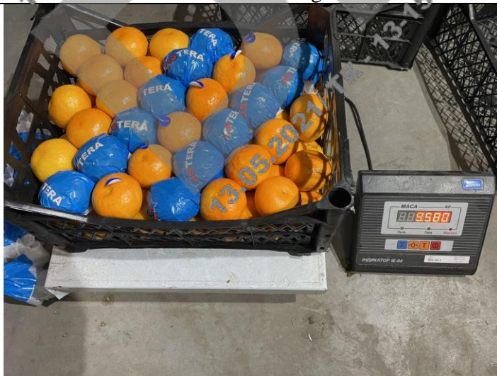
Weight of №4 box