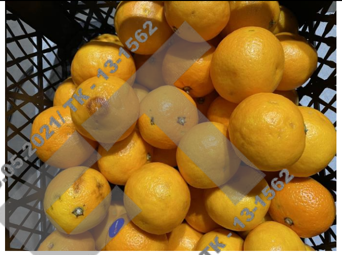
View of bad cargo