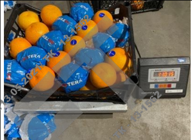
Weight of № 3 box