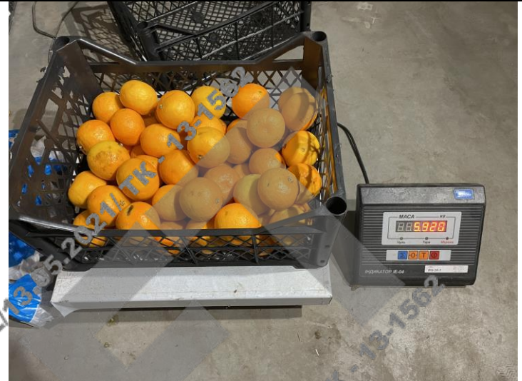
Weight of bad cargo