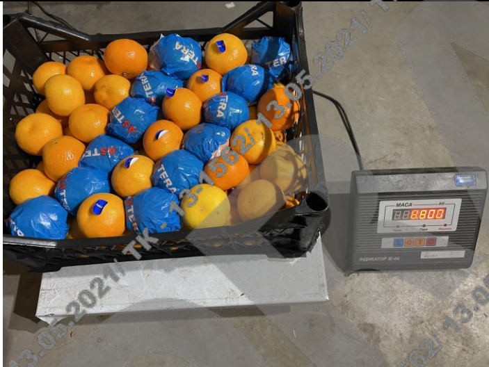
Weight of № 3 box