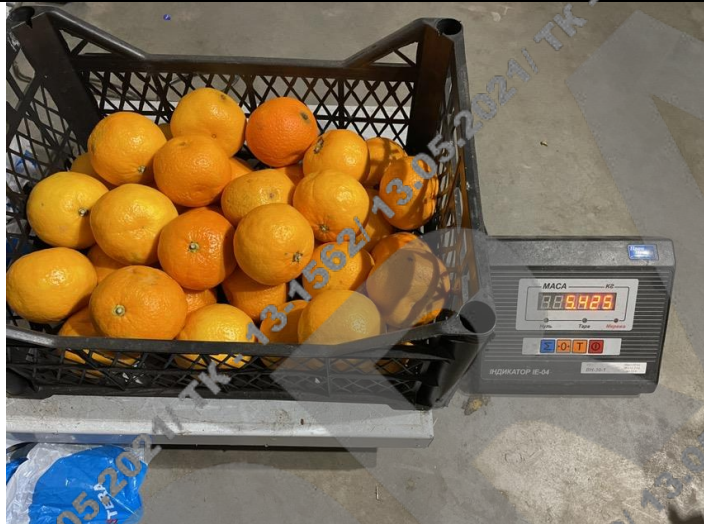
Weight of bad cargo