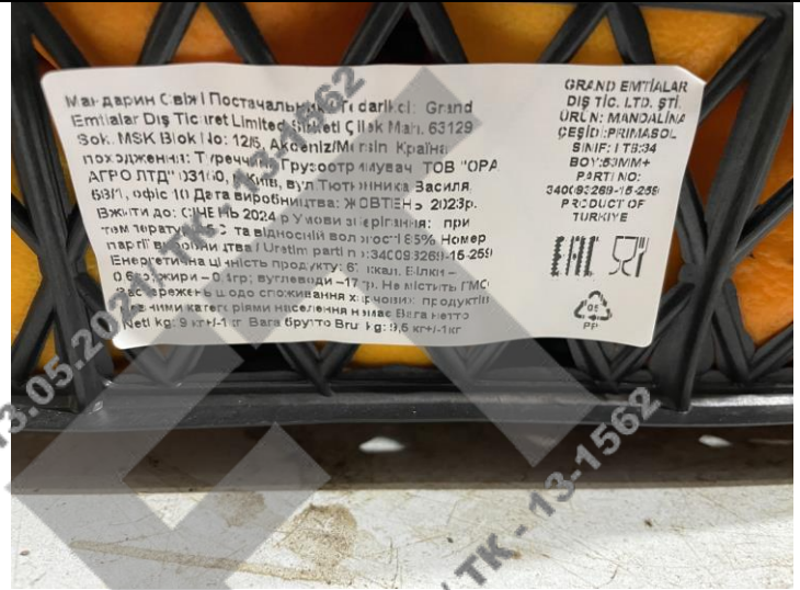
Label on Box