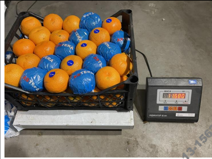
Weight of № 1 box

CISS GROUP UKRAINE LLC 65037, Lymanka village, Ovidiopol district 5, Odessa Blv., Odessa region, www.ciss-group.com