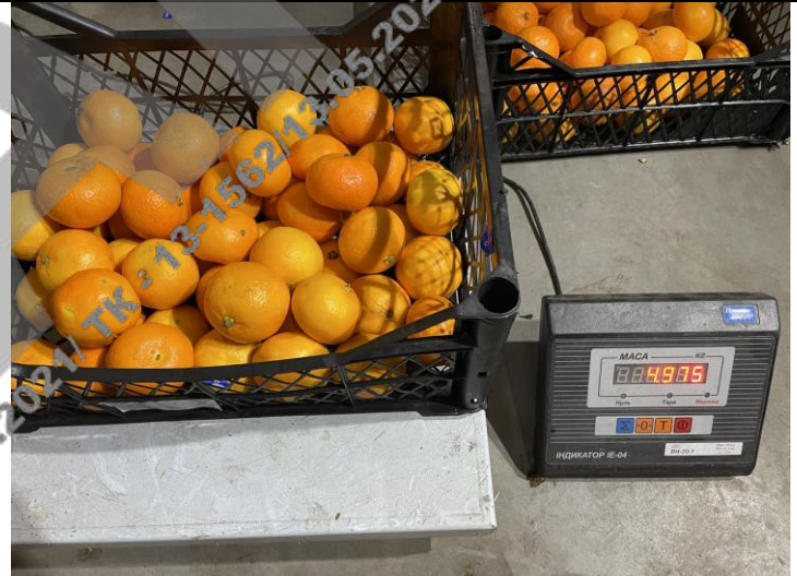
Weight of bad cargo