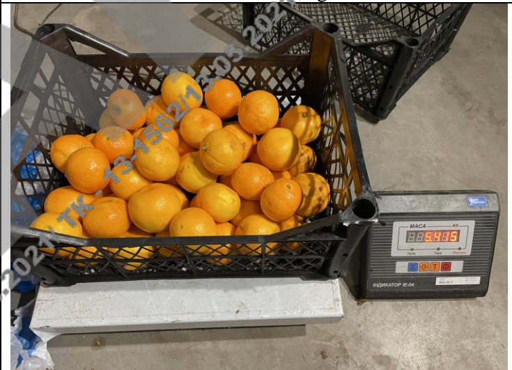
Weight of bad cargo