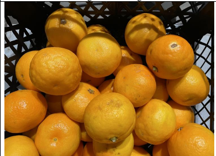
View of bad cargo