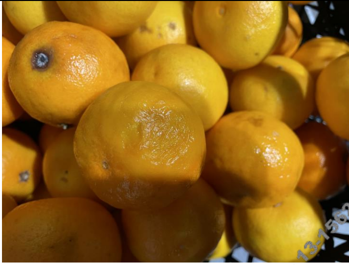
View of bad cargo

CISS GROUP UKRAINE LLC 65037, Lymanka village, Ovidiopol district 5, Odessa Blv., Odessa region, www.ciss-group.com