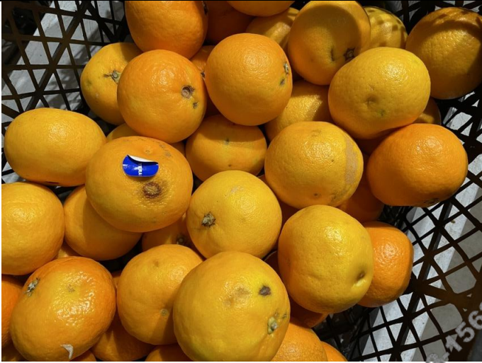
View of bad cargo

CISS GROUP UKRAINE LLC 65037, Lymanka village, Ovidiopol district 5, Odessa Blv., Odessa region, www.ciss-group.com