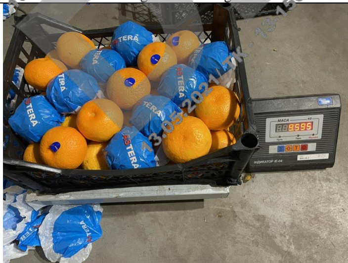
Weight of № 6 box