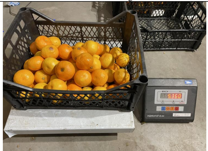
Weight of bad cargo