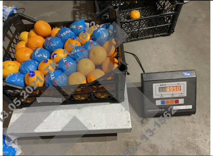
Weight of № 5 box