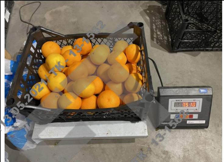
Weight of bad cargo