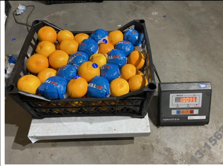
Weight of № 1 box

CISS GROUP UKRAINE LLC 65037, Lymanka village, Ovidiopol district 5, Odessa Blv., Odessa region, www.ciss-group.com