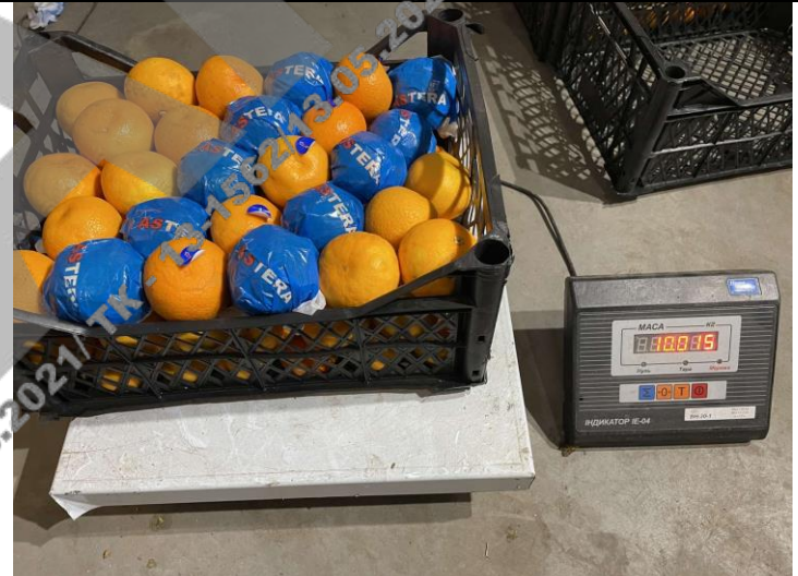
Weight of № 2 box