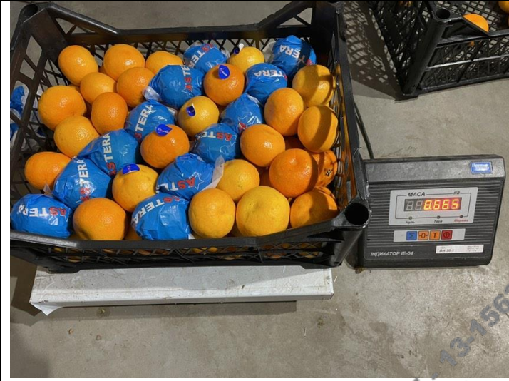
Weight of № 3 box

CISS GROUP UKRAINE LLC 65037, Lymanka village, Ovidiopol district 5, Odessa Blv., Odessa region, www.ciss-group.com