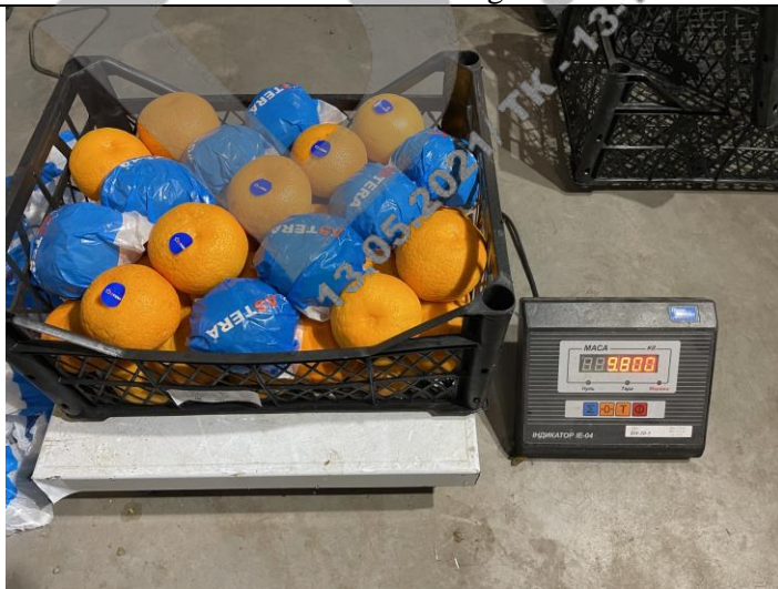
Weight of № 2 box