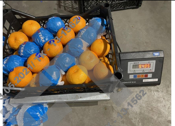
Weight of № 5 box