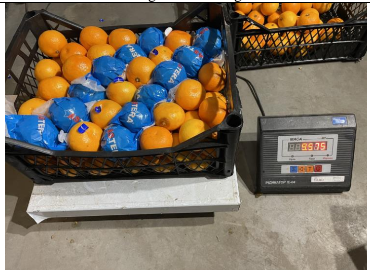
Weight of № 4 box