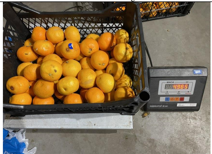
Weight of bad cargo