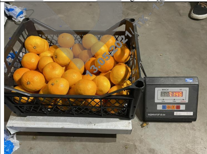
Weight of bad cargo