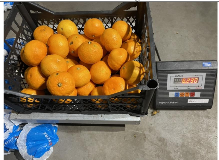
Weight of bad cargo