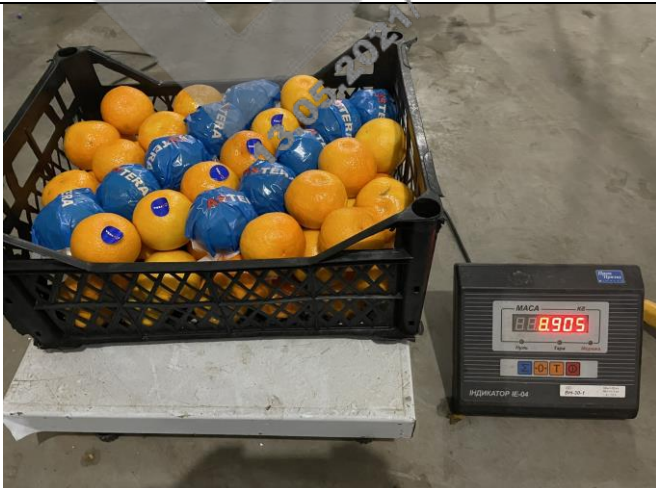
Weight of №1 box