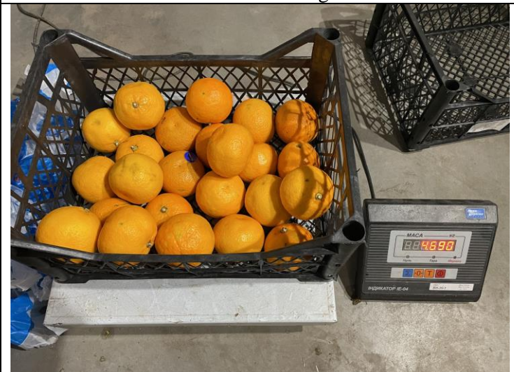
Weight of bad cargo