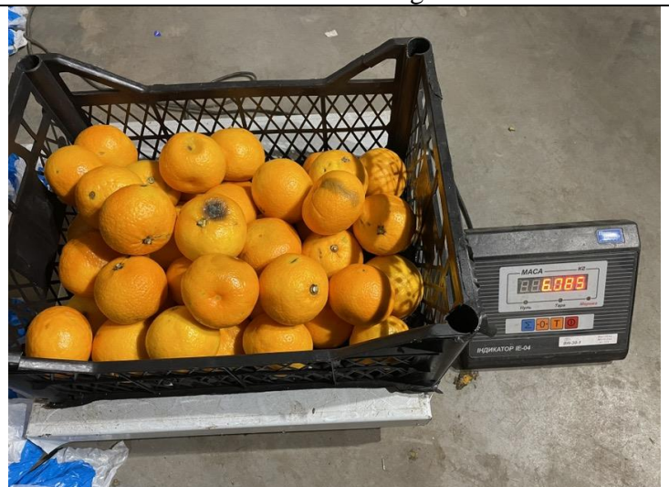
Weight of bad cargo