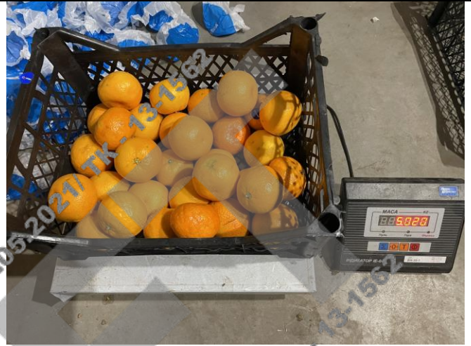
Weight of bad cargo