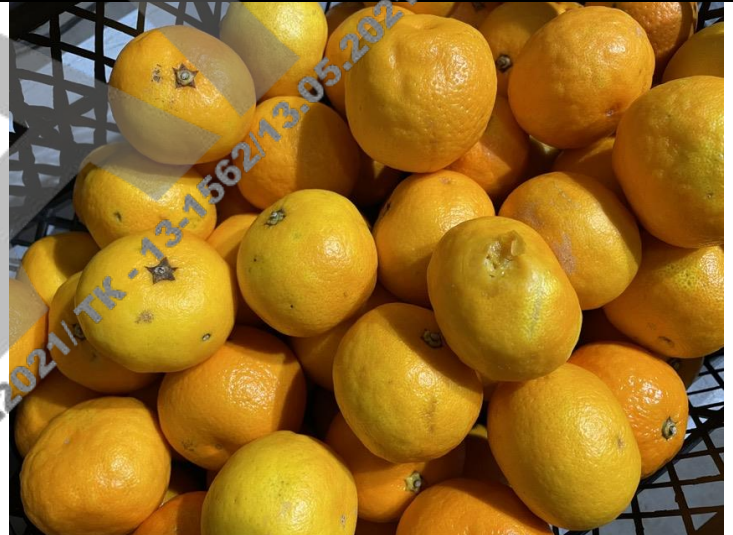
View of bad cargo