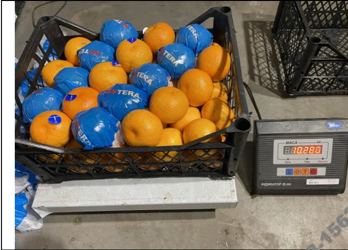
Weight of № 4 box

CISS GROUP UKRAINE LLC 65037, Lymanka village, Ovidiopol district 5, Odessa Blv., Odessa region, www.ciss-group.com