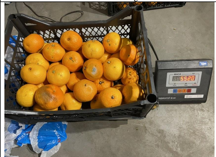
Weight of bad cargo