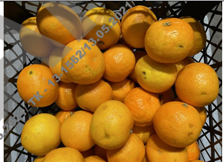
View of bad cargo