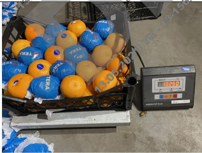
Weight of № 2 box