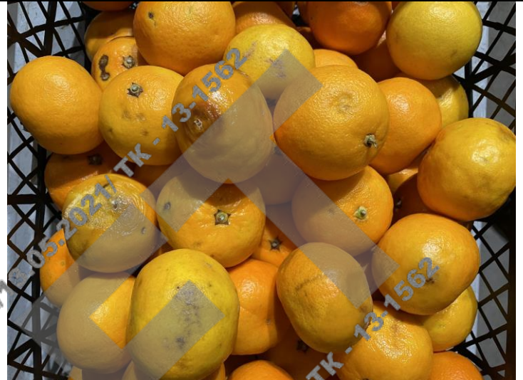
View of bad cargo