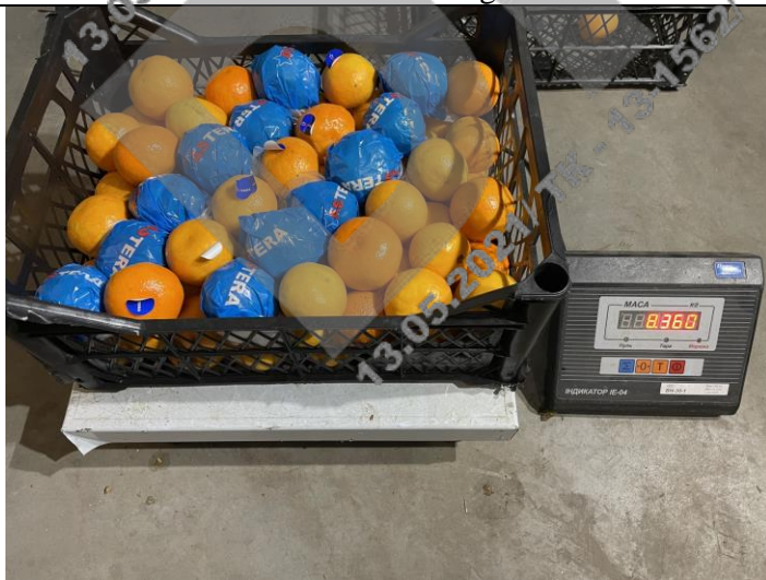
Weight of № 2 box