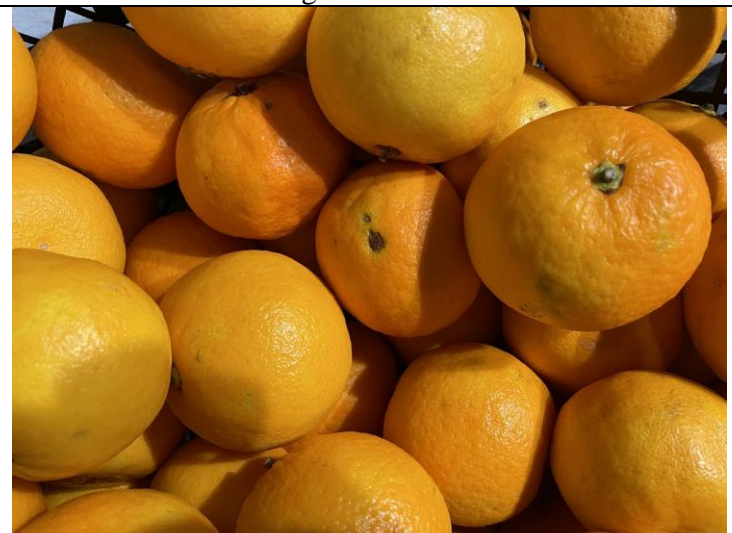
View of bad cargo