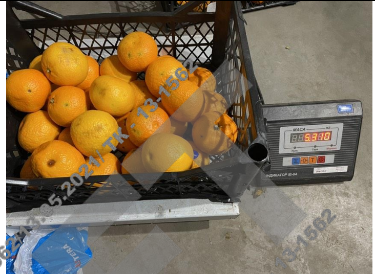
Weight of bad cargo