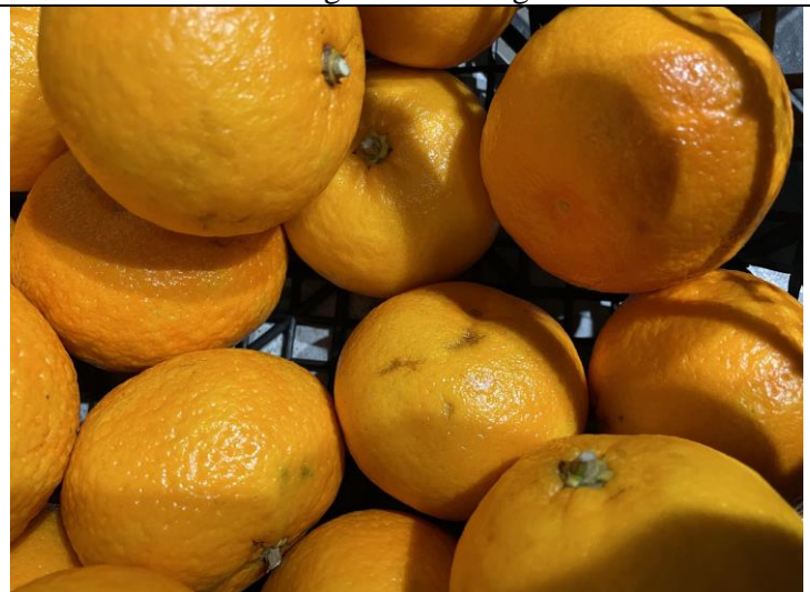
View of bad cargo