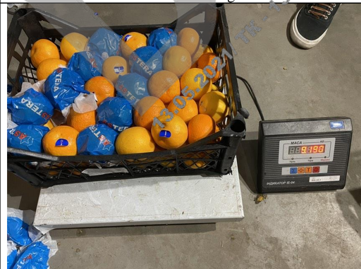
Weight of № 4 box