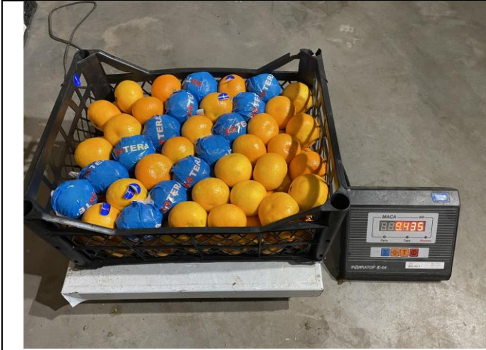
Weight of № 1 box

CISS GROUP UKRAINE LLC 65037, Lymanka village, Ovidiopol district 5, Odessa Blv., Odessa region, www.ciss-group.com