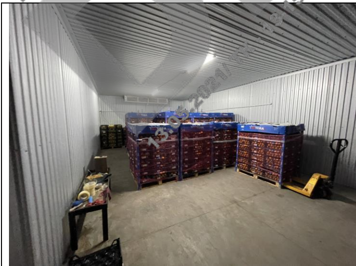
Views of pallets with cargo