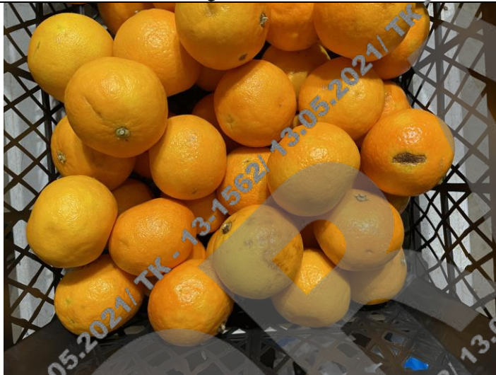
View of bad cargo