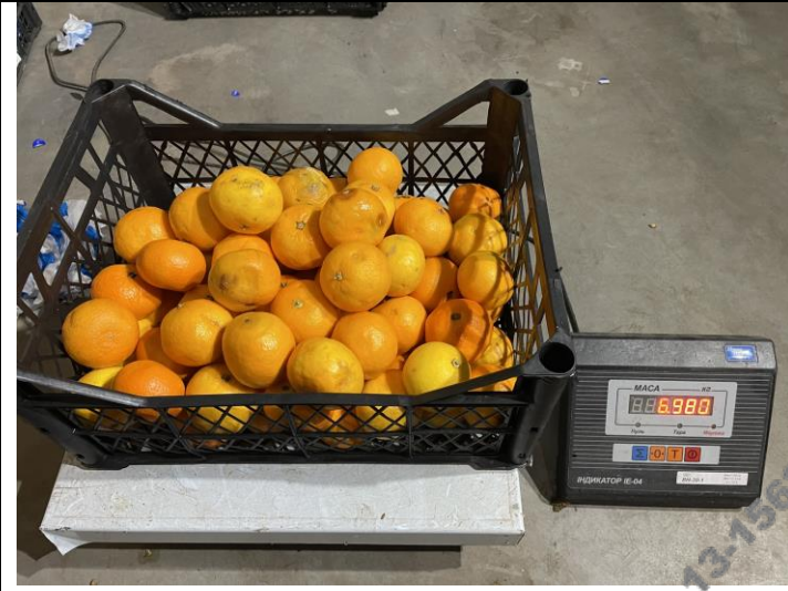
Weight of bad cargo

CISS GROUP UKRAINE LLC 65037, Lymanka village, Ovidiopol district 5, Odessa Blv., Odessa region, www.ciss-group.com