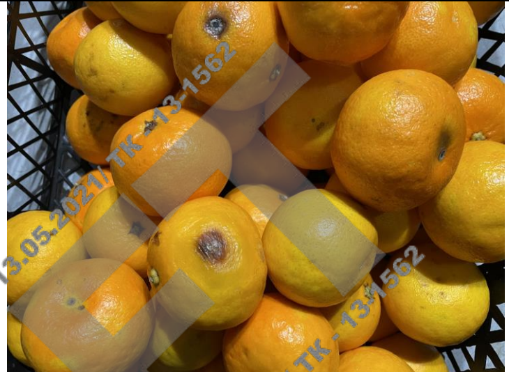
View of bad cargo