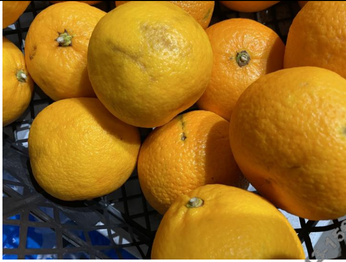
View of bad cargo

CISS GROUP UKRAINE LLC 65037, Lymanka village, Ovidiopol district 5, Odessa Blv., Odessa region, www.ciss-group.com