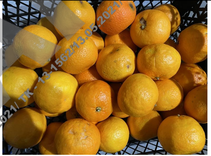
View of bad cargo