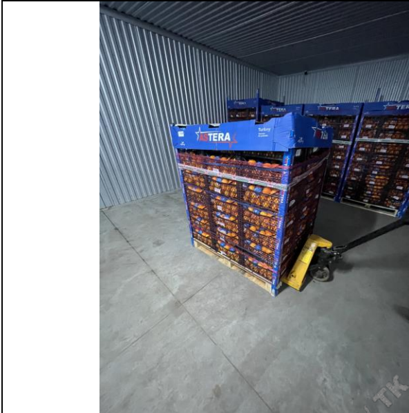
Views of pallets with cargo

CISS GROUP UKRAINE LLC 65037, Lymanka village, Ovidiopol district 5, Odessa Blv., Odessa region, www.ciss-group.com