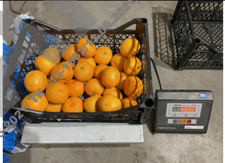
Weight of bad cargo