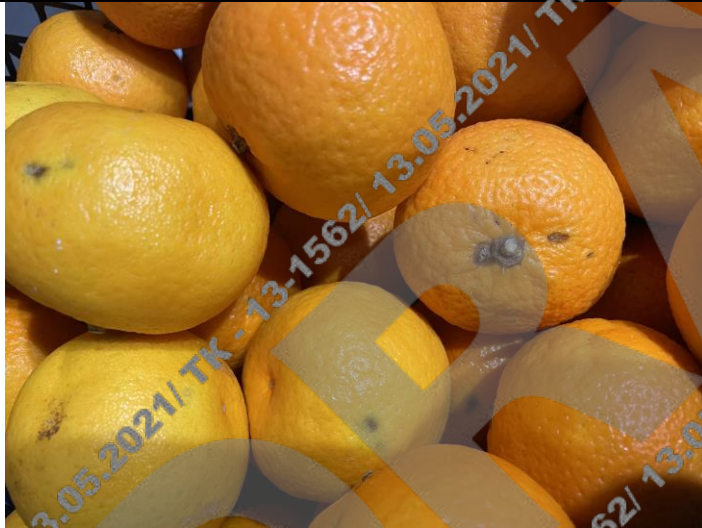
View of bad cargo