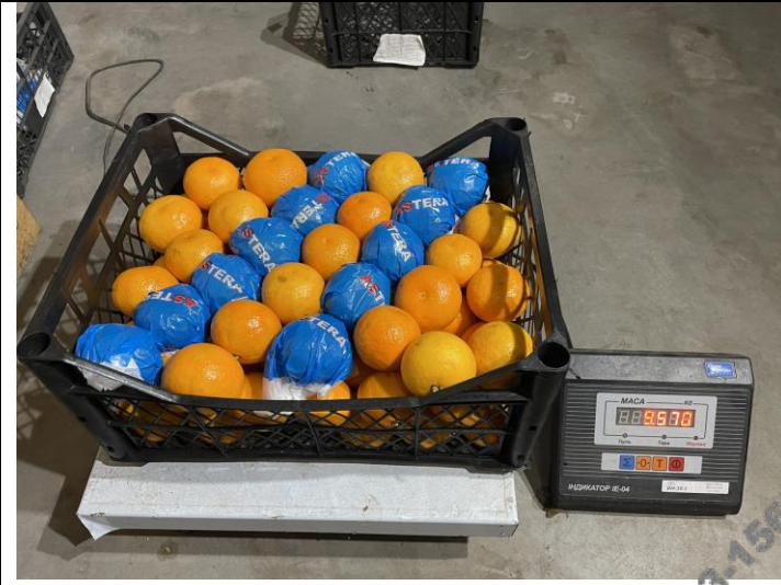
Weight of № 3 box

CISS GROUP UKRAINE LLC 65037, Lymanka village, Ovidiopol district 5, Odessa Blv., Odessa region, www.ciss-group.com