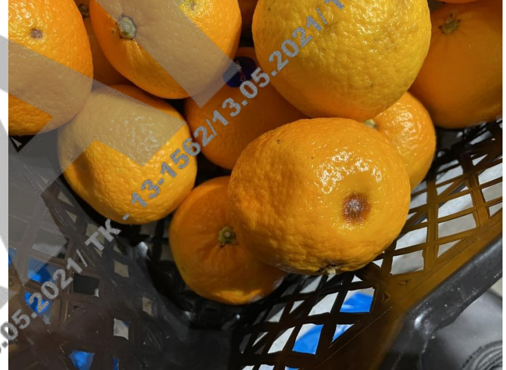
View of bad cargo