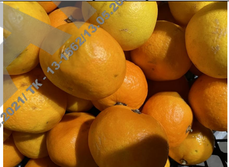
View of bad cargo