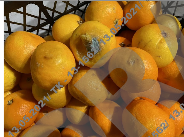
View of bad cargo