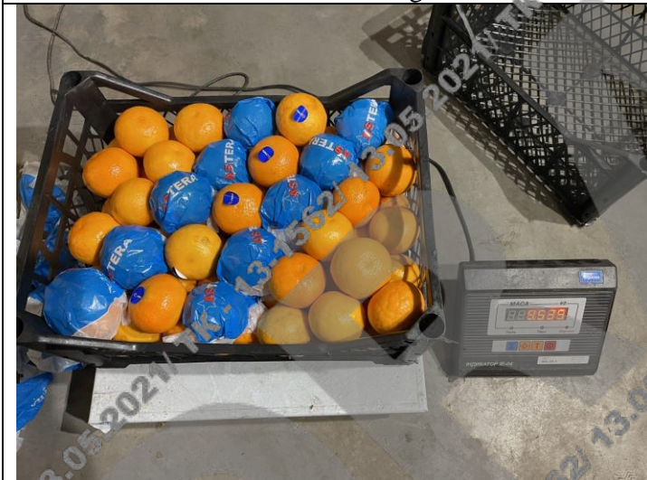
Weight of № 2 box