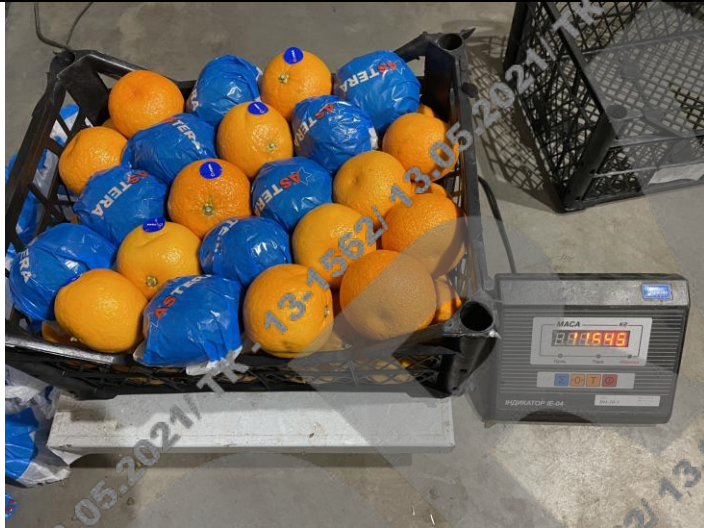
Weight of № 3 box