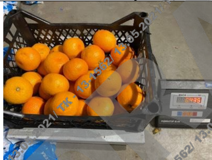
Weight of bad cargo