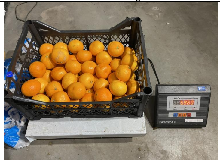
Weight of bad cargo