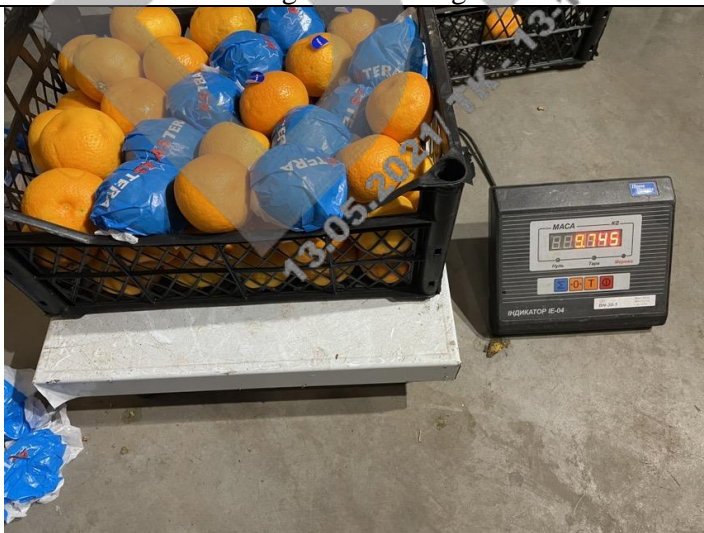
Weight of № 6 box