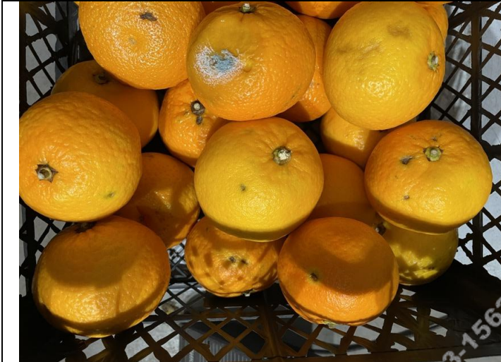
View of bad cargo

CISS GROUP UKRAINE LLC 65037, Lymanka village, Ovidiopol district 5, Odessa Blv., Odessa region, www.ciss-group.com