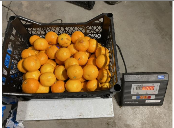
Weight of bad cargo