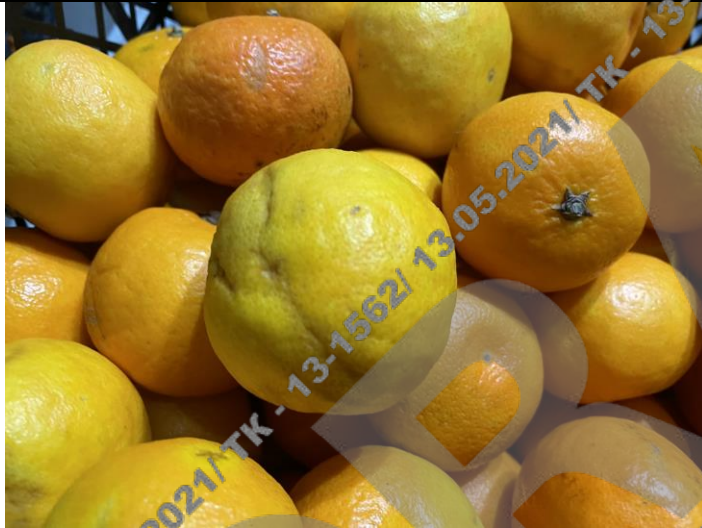
View of bad cargo